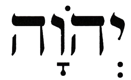
The Name of Almighty God YeHoVaH in Hebrew