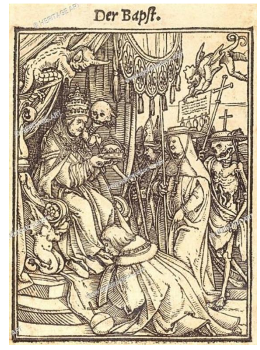
Charlamagne being crowned by the pope.

The split between the Hebrew origins of the ecclesia (church) and this new wholly gentile religion of Christianity grew wider and wider until it became indistinguishable from many other pagan Roman